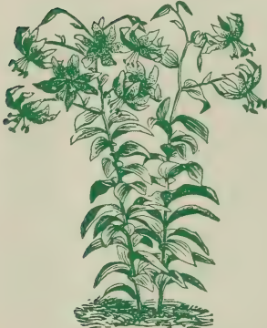
Lilium Tigrinum, Single.

These are the most fragrant, beautiful and stately of all flowers produced from bulbs; they require very little care. Do not disturb them oftener than every three to five years. Plant about six to twelve inches deep, according to size of bulb, and if the ground is not well drained, use plenty of sand around the bulb, and lay it on its side. Plant in clusters or groups of six or more for best effect. The Harrissii and Longiflorum Lilies force very easily. The Speciosum are, next to the Auratums, the most magnificent species for outdoor culture. They increase in size and beauty each year.